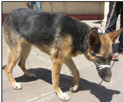
Plate 01: Case 6, pre-operative loss of weight bearing